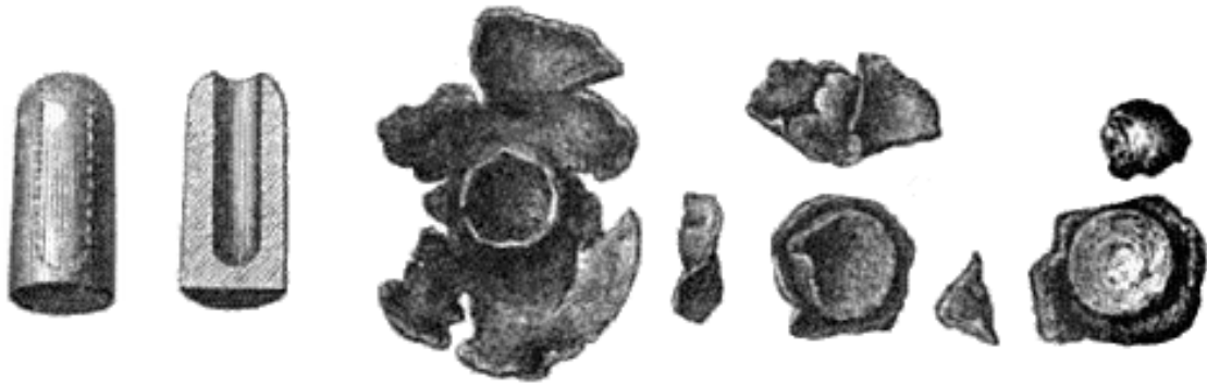
Cross sectional views of the Dum-Dum Bullet