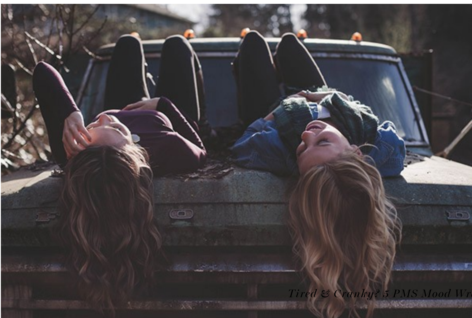
Tired & Cranky? 5 PMS Mood Wranglers

( http://www.frankihobson.com/life/health-wellbeing/tired-uninspired-3-easy-life-tweaks-try )