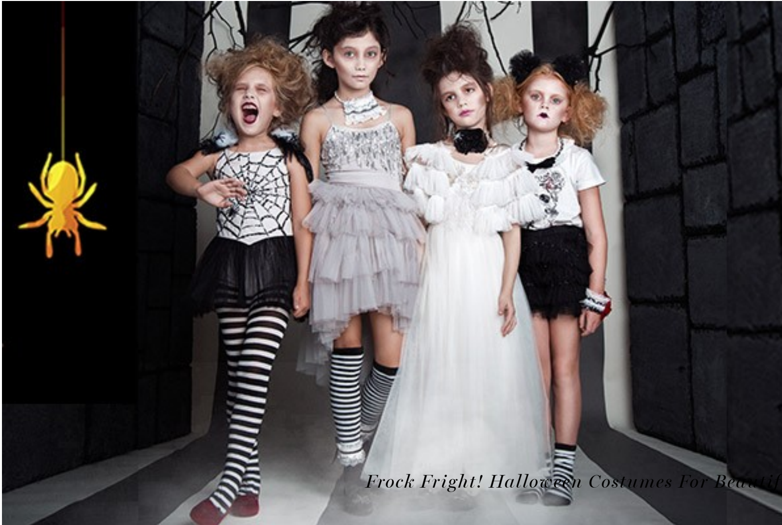
Frock Fright! Halloween Costumes For Beautiful Nightmares

http://www.frankihobson.com/family/scummy-mummies-speak-out