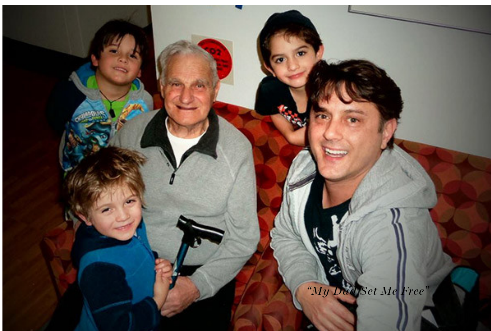
"My Dad Set Me Free"

( http://www.frankihobson.com/family/making-kids-maths-homework-fun )