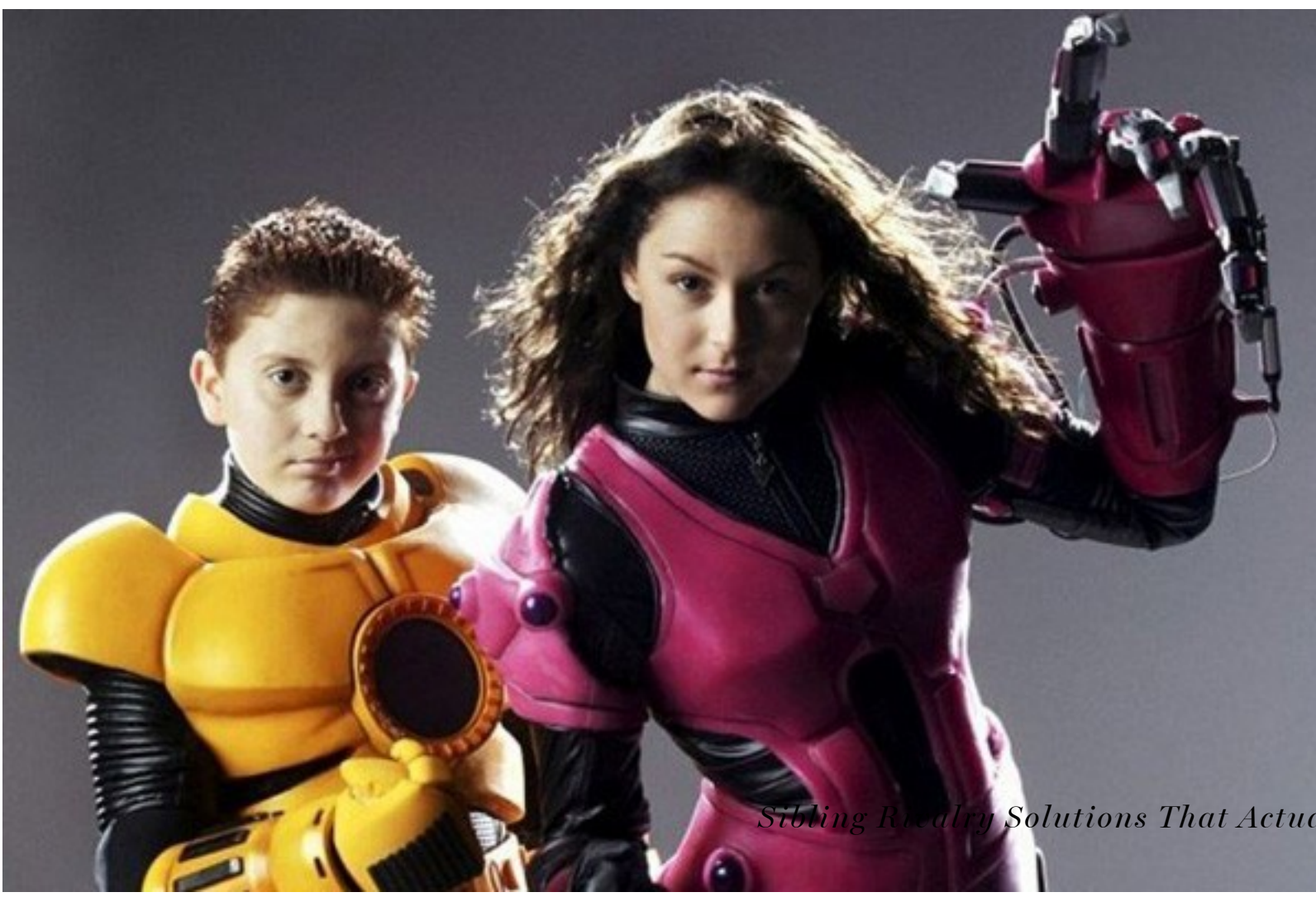
Sibling Rivalry Solutions That Actually Work!

( http://www.frankihobson.com/family/parenting/sibling-rivalry-solutions-actually-work )