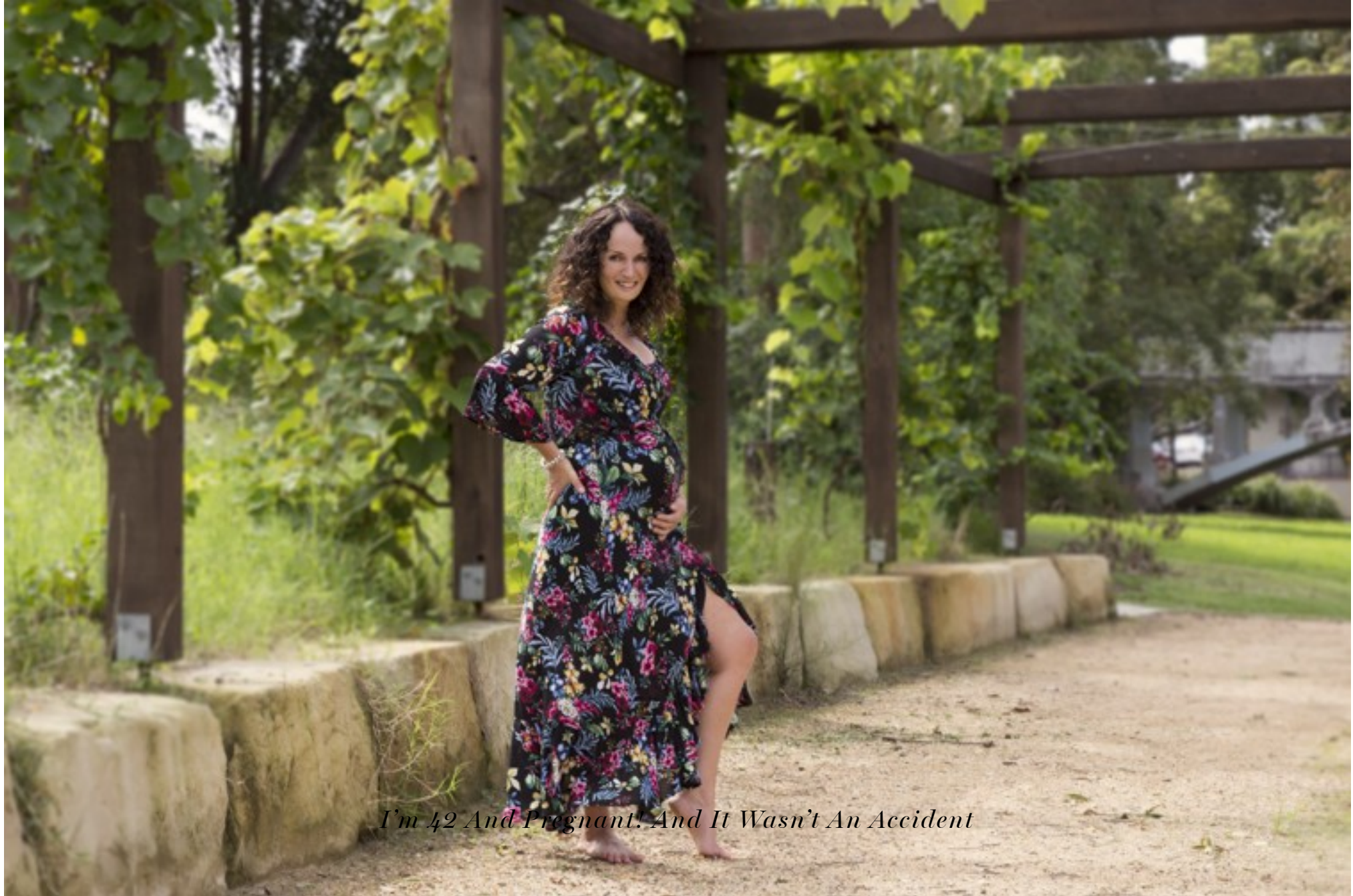
I'm 42 And Pregnant! And It Wasn't An Accident

( http://www.frankihobson.com/family/pregnancy/im-42-and-pregnant-it-wasnt-an-accident )