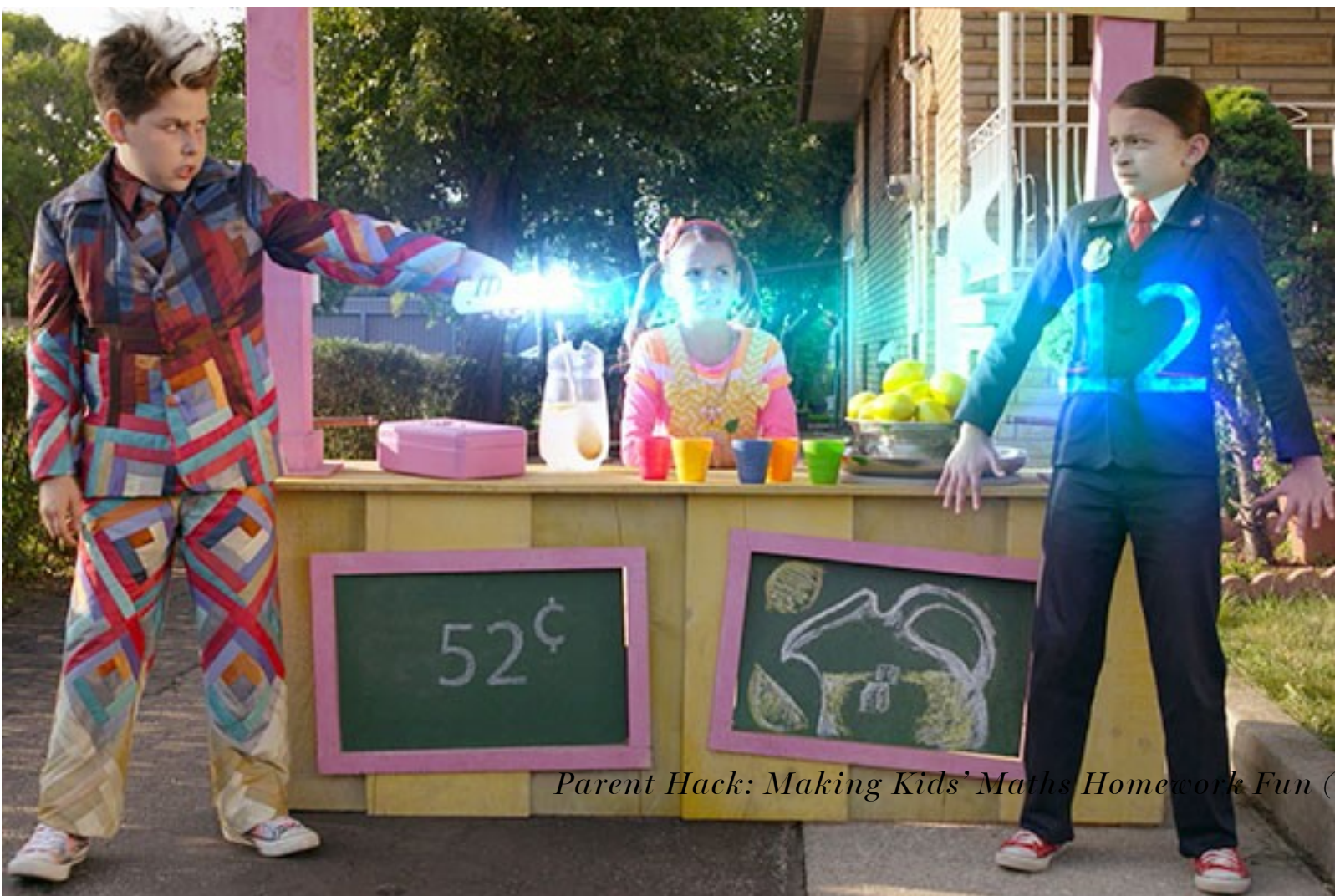
Parent Hack: Making Kids' Maths Homework Fun (When You've Forgotten ...