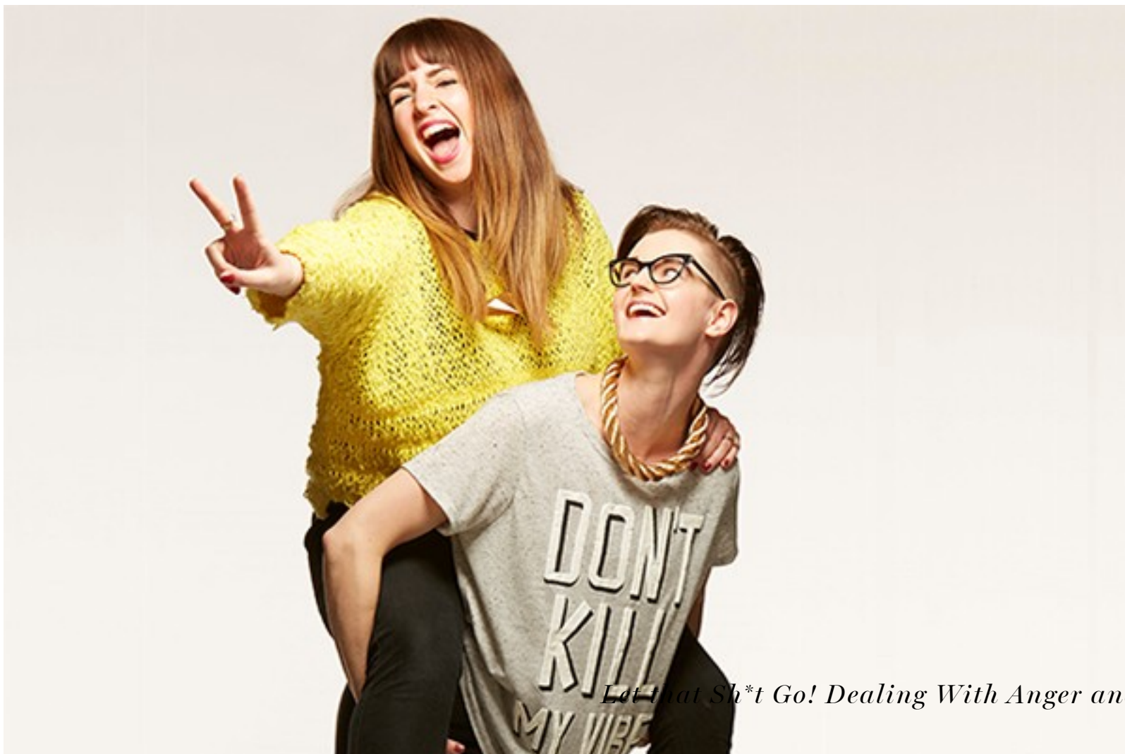
Let it Sh*t Go! Dealing With Anger and Resentment

http://www.frankihobson.com/life/health-wellbeing/dealing-with-anger-