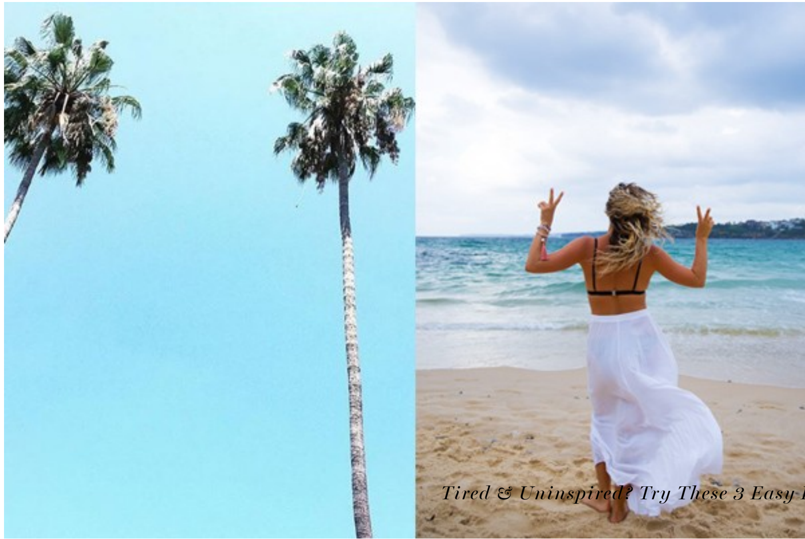
Tired & Uninspired? Try These 3 Easy Life Tweaks

( http://www.frankihobson.com/family/parenting/sibling-rivalry-solutions-actually-work )